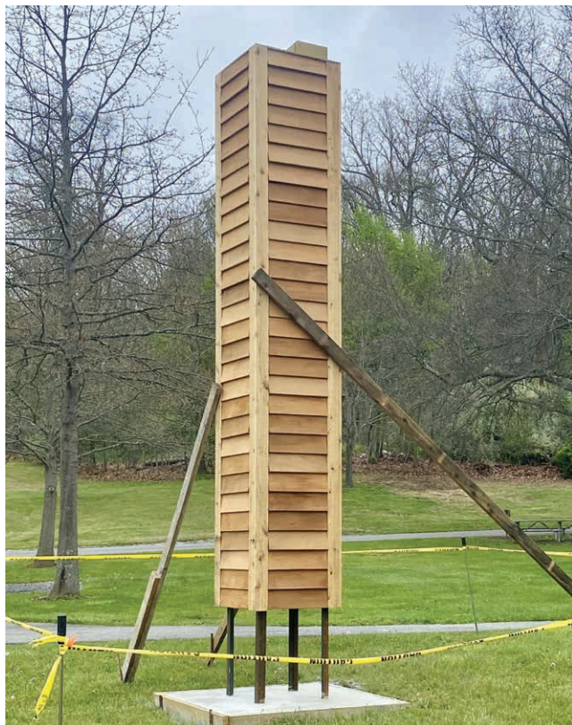
A HABITAT FOR WILDLIFE: The Chimney Swift Tower was installed at Shawnee State Park in April in partnership with the Pennsylvania Game Commission. It's part of a statewide nesting program.

"I try to select a site for each tower that is open, close to a building and will have public visibility," he says.