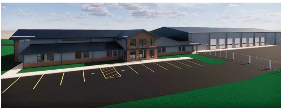
NEW HEADQUARTERS: Plans for the new facility are underway. Construction will begin soon with a completion date in early 2026.

The random door prize drawing is complete. Winners will be notified by mail.