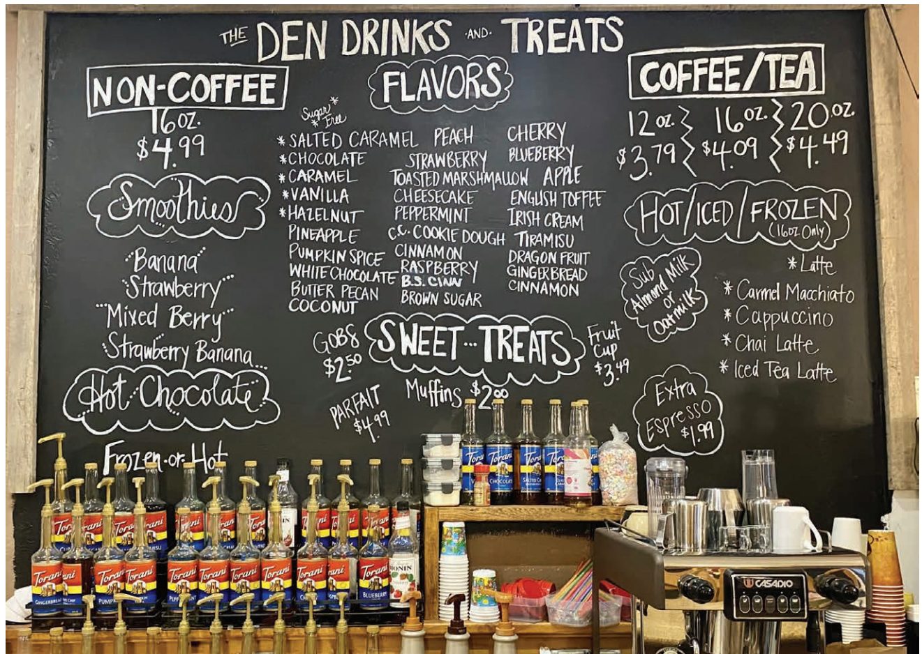
SWEETS, TREATS AND MORE: The Lion's Den Café in Fishertown offers a wide variety of flavors for all coffee lovers.

If you're a coffee lover, the cafe features a full menu of specialty hot, frozen, or iced coffees, lattes, cappuccinos, and mochas with an impressive array of flavors. Not a fan of coffee? Chai tea, lemonade and hot chocolate are also available.