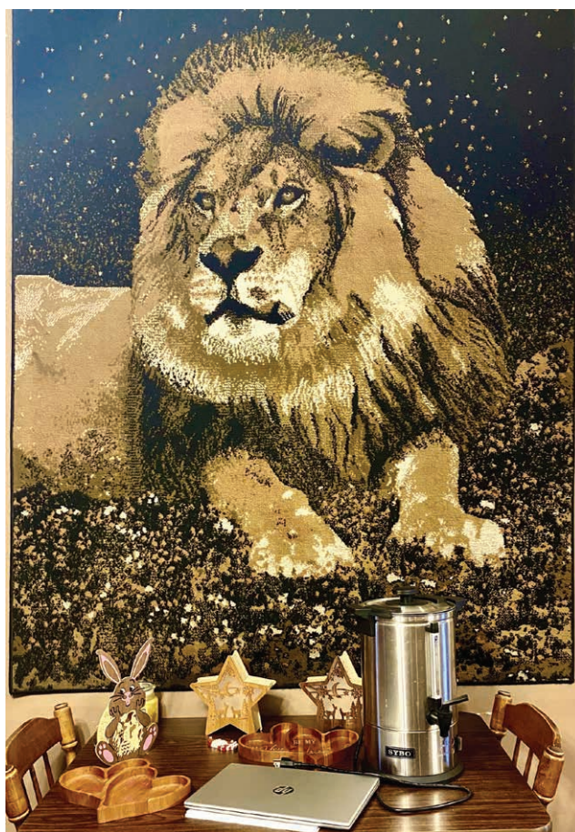
TAKE A LOAD OFF: The café has a cozy atmosphere that attracts locals for breakfast and lunch Monday through Saturday.

breakfast. The menu offers a large spread with everything from pancakes and waffles to bacon and eggs. Bring the kids in for a lunch of burgers and wraps. The cozy atmosphere makes it the perfect place to enjoy the company of loved ones over a good meal.