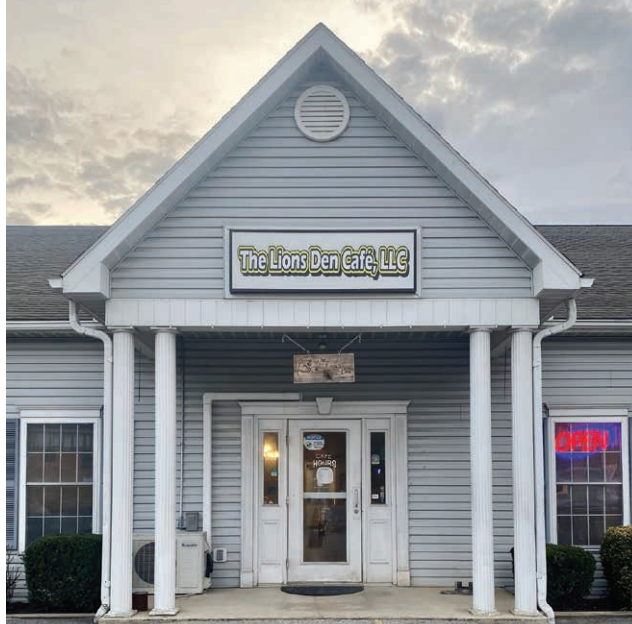
CELEBRATING 10 YEARS: The Lion's Den Café in Fishertown is celebrating its 10th anniversary this month. The business is located across from the Chestnut Ridge Middle School.

Stop in with some friends and family for a hearty