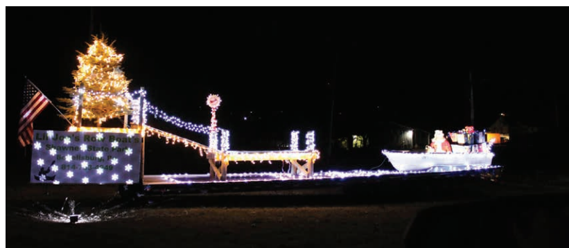
BRIGHT LIGHTS: Shawnee State Park transforms the Bedford County Fairgrounds into lights on a lake.