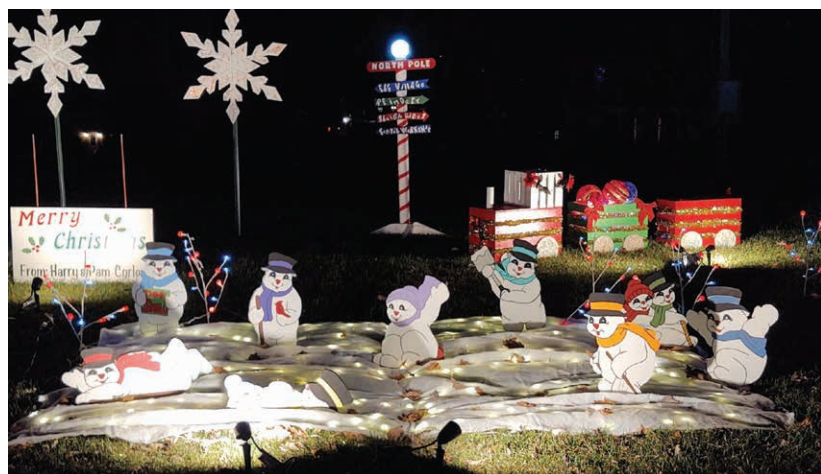
SNOW PROBLEM: Snow people joyfully take part in the Holiday Nights of Lights.

Gates are open from 6 to 9 each night, weather permitting. Learn more at bedfordcountychamber.com/holiday-lights .