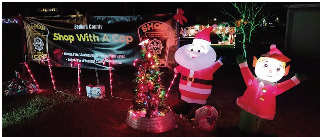
SHOP WITH A COP: Santa Claus and one of the elves decide to shop with a cop at the State Police display during the Holiday Nights of Lights.

And just how involved do these local businesses and community groups get when it comes to Holiday Nights of Lights? During the first year, the goal was to have at least 30 groups create displays. More than 70 businesses and organizations blessed the fairgrounds with their creativity. Even during the height of COVID-19 in 2020, more than 100 displays lined the grounds. This year, more than 160 businesses and groups will share displays. The event