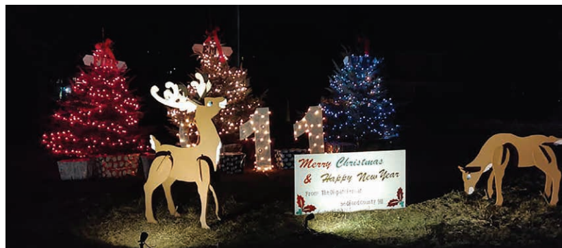
REINDEER GAMES: Some other reindeer friends stand in for Rudolph at the holiday display created by the Bedford County 911 Call Center.