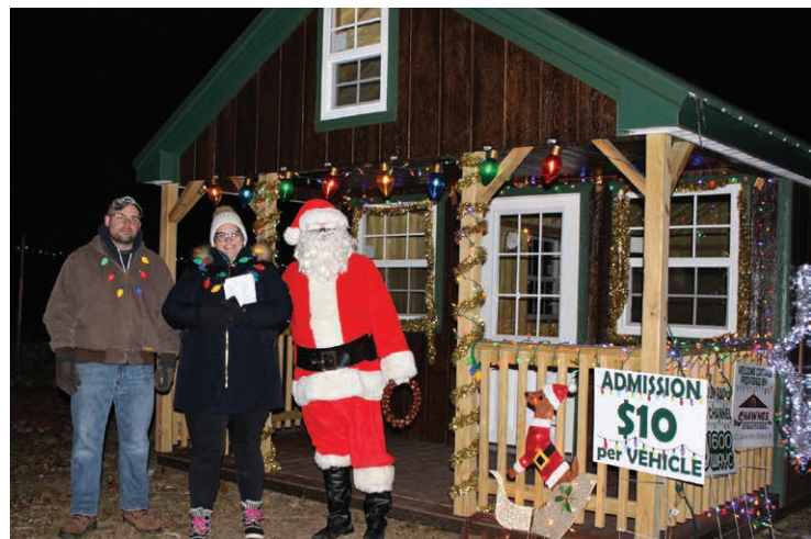
WELCOME COTTAGE: Santa leans in for a photo with some volunteers at the Welcome Cottage during the 2022 Holiday Nights of Lights.