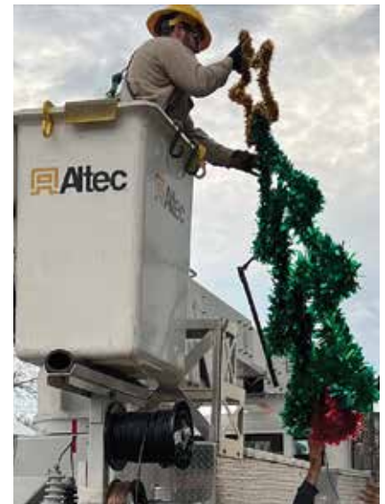
A GROUP EFFORT: Businesses, organizations and individuals come together every year to hang Christmas lights and decorations in Everett and Bedford. Above, Bedford REC lineworkers lend a helping hand in Bedford.