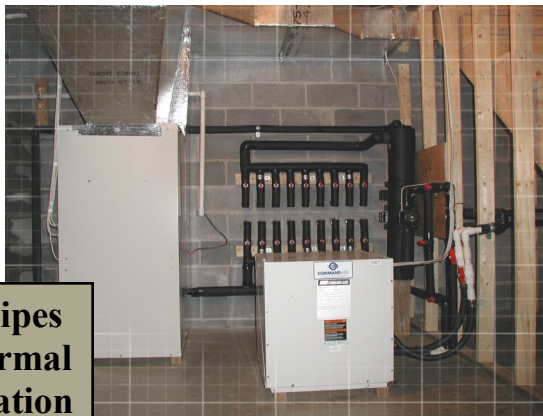
Manifold Pipes and Geothermal Unit Installation